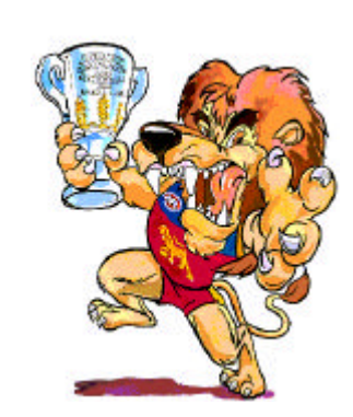
Premiers 2003 Under 11 Brown Under 12 Green